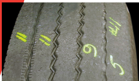
One Sided Wear