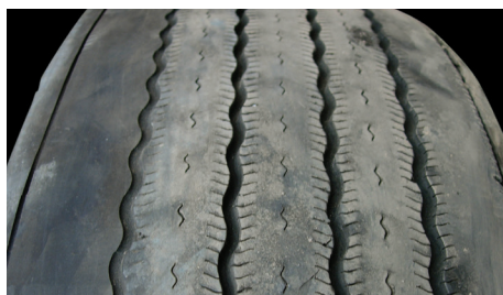
Shoulder Step Wear