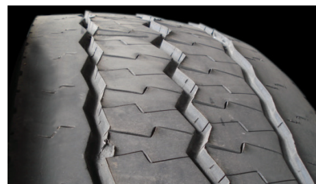
Radial Feather Wear