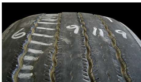
Depression Wear (Intermediate)