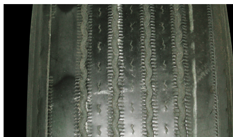
Depression Wear (Shoulder)